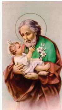
St. Bernadine of Siena

“In him the Old Testament finds its fitting close. He brought the noble line of patriarchs and prophets to its promised fulfillment. What the divine good had offered as a promise to them, Joseph held in his arms.”