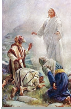
The Transfiguration -- Harold Copping