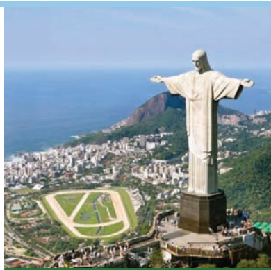
Statue of Christ the Redeemer -- Rio de Janeiro

Rejoice and leap for joy on that day! Behold, your reward will be great in heaven. LUKE 6: 17, 20-26