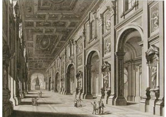
19TH-CENTURY ENGRAVINGS (INDIANAPOLIS MUSEUM OF ART)