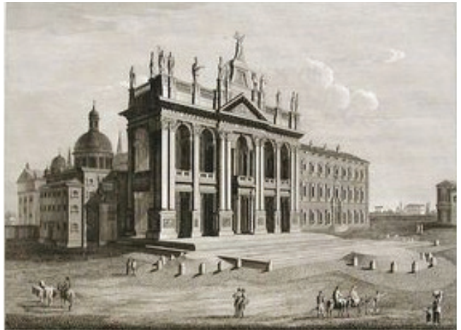
EXTERIOR OF SAINT JOHN LATERAN