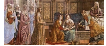
Birth of St. Mary Domenico Ghirlandajo