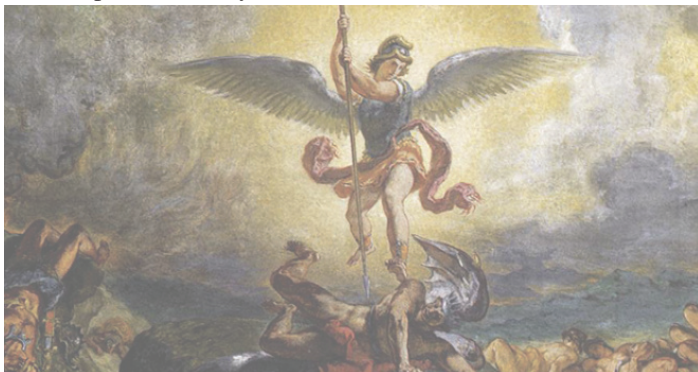
SAINT MICHAEL DEFEATS THE DEVIL - EUGENE DELACROIX