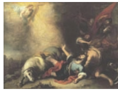
The Conversion of St. Paul. Bartolome Murillo

25 JAN (Wednesday): THE CONVERSION OF SAINT PAUL