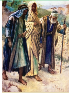
The Walk to Emmaus -- Harold Copping (1927)