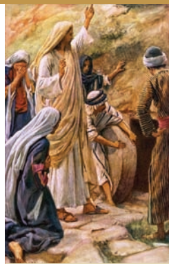
Lazarus, Come Forth! -- Harold Copping