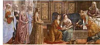
Birth of St. Mary Domenico Ghirlandajo