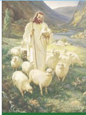
The Good Shepherd, Warner Sallman