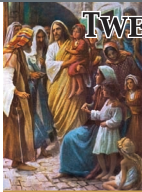
Suffer the Children to Come to Me -- Harold Copping