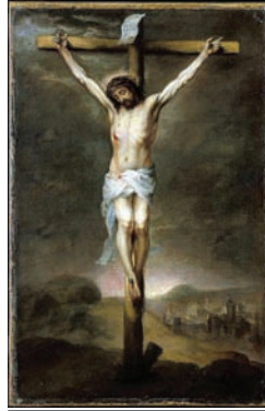
The Crucifixion - Bartolome Esteban Murillo