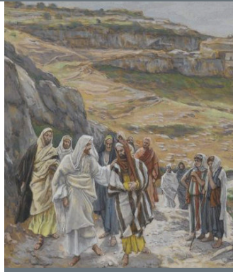
Jesus Discourses with His Disciples -- Tissot