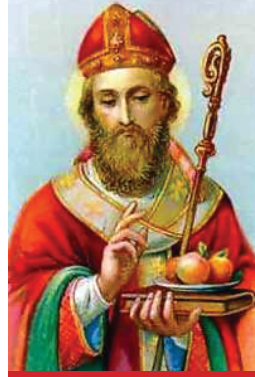
St. Nicholas of Myra